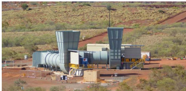
Figure 1. Full turnkey project for Newmont Tanami VR6 main ventilation fans with the installation of multiple monitoring systems.

Over the past decade, as the Industrial Internet of Things (IIoT) has accelerated globally, remote condition monitoring has quickly become a popular solution to