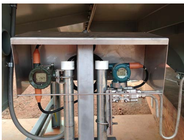
Figure 3. Newmont Tanami VR6 shaft collar pressure and air temperature monitors transmit real-time data with an automatic calibration.

effectively manage and maintain mine ventilation equipment.